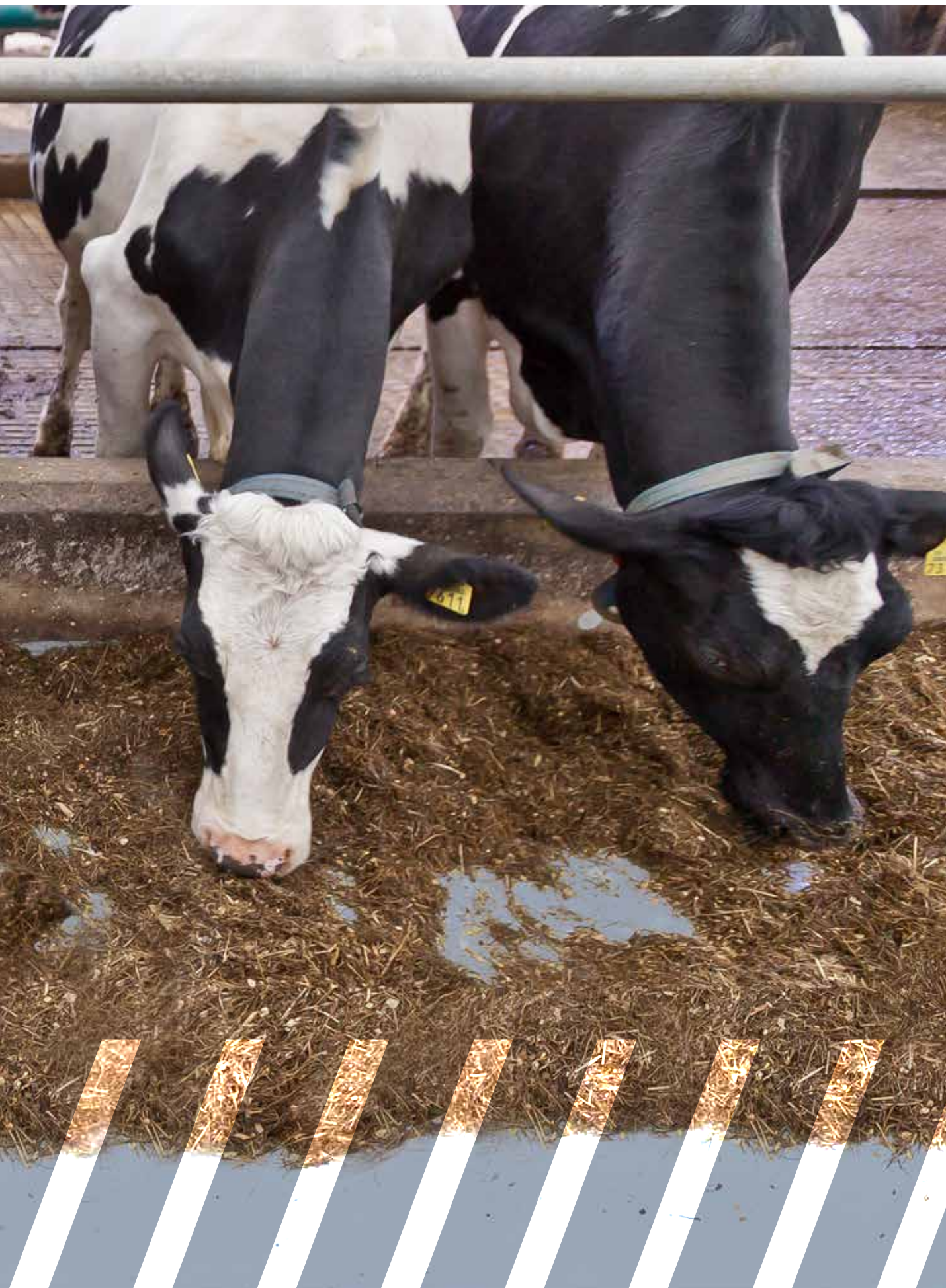
Shown with DeLaval Plast™ coating