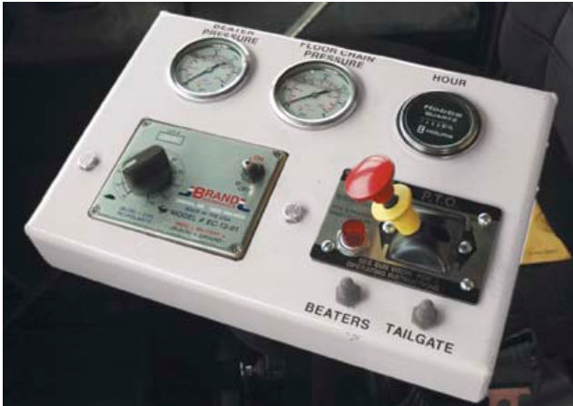
Ease of use cab control panel.