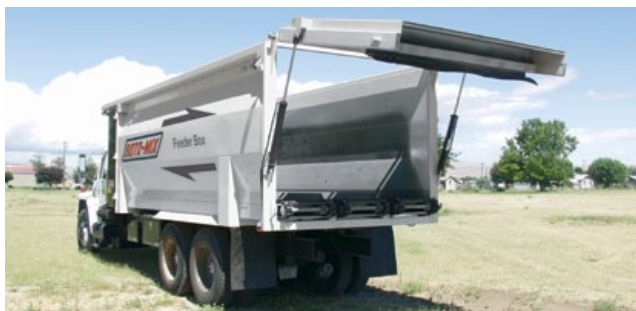
Rear Discharge - tailgate opens with two hydraulic cylinders to near 90 degrees.