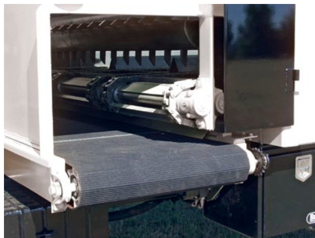
Side Discharge - available with belt, chain & slat, or auger option.