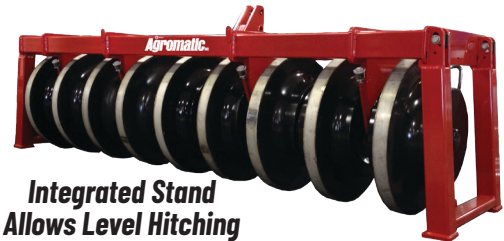
Integrated Stand Allows Level Hitching