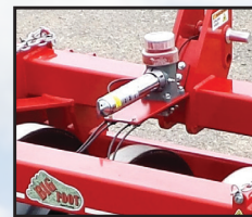
Optional Electronic Lubrication System:

This product is protected by USPN 10,654,325