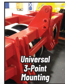
Universal 3-Point Mounting