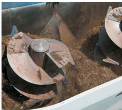
Twin augers available in single flighting.