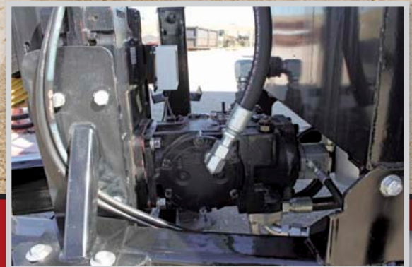
H-Series Variable Speed Hydrostatic Drive Performance