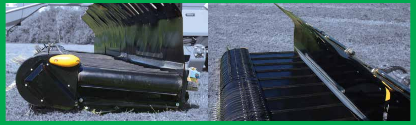
NEW! Wide 40" conveyor with a rear profiled slope. More room for heavier crop and the 5° angle distribute the crop more evenly for a better windrow

NEW! Improved CAM profile for better pick-up and delivery onto the conveyor