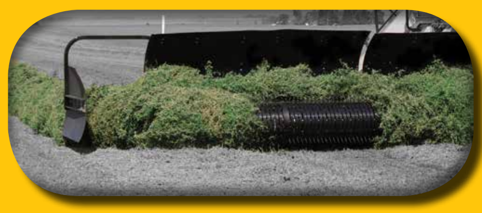
Optional dry hay skirt provides more harvesting flexibility

NEW! Easier access to the merger hydraulic system