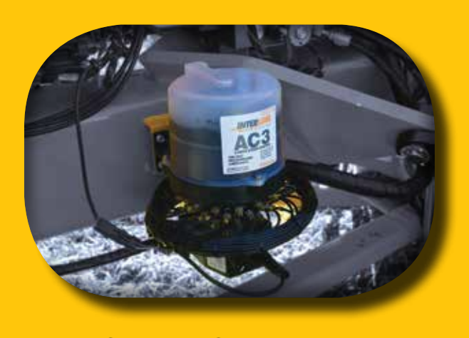
NEW! Quick access allows you to fill or monitor OPTIONAL auto-lube