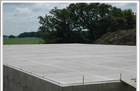
STEEL REINFORCED W/ 2 STEEL MATS CUSTOM SIZES AVAILABLE